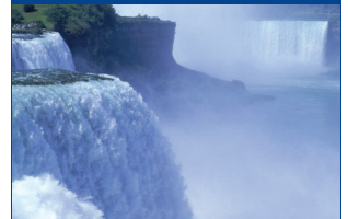
World's most famous Falls