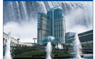
Gaming at Fallsview Casino