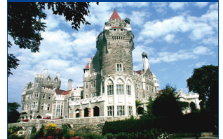
Magnificent Casa Loma Castle in Toronto