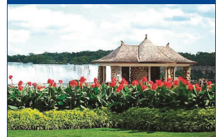
Visit beautiful Queen Victoria Park

Departure: Wood Dale Park District, 111 E. Foster Ave., Wood Dale, IL @ 8 am